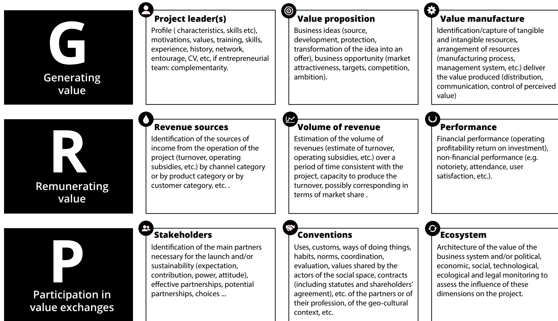
Figure A1. Dimensions, Components and Items of the BM GRP